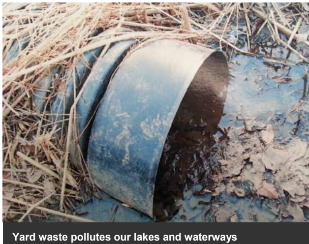
Yard waste pollutes our lakes and waterways