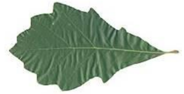
Swamp White Oak