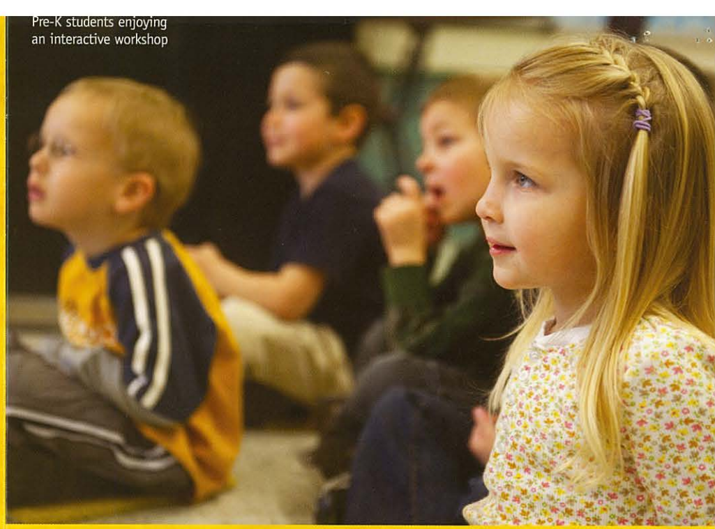
Pre-K students enjoying an interactive workshop