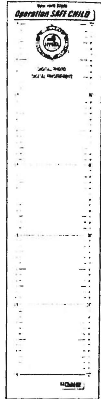
Analog Weight Scale & Custom Height Chart with PVC Stand included!

Your EZ Child ID Turnkey system is ready to go right out of the box. The software has been customized for Operation SAFE CHILD. We even pre-install it with your departments information. It works with standard 8.5 x 11 paper and standard CD-R disks to burn the child's data. You can also add the optional PVC card printer, or it will work with your existing PVC card printer.