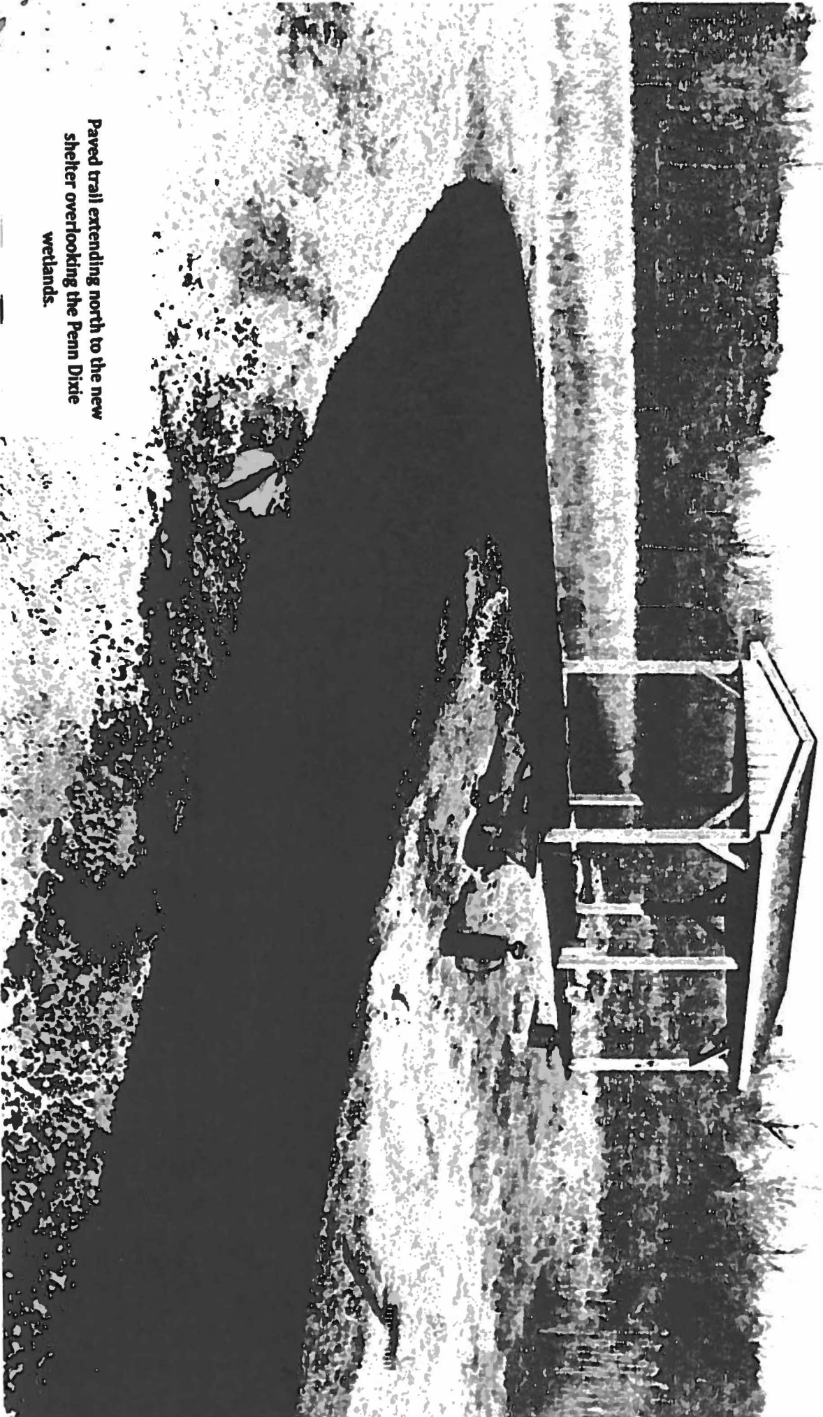
Paved trail extending north to the new shelter overlooking the Penn Dixie wetlands.