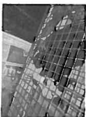
just one of our TNVR cats

BestFurPets, Inc. has helped various Erie County cat colonies w/ TNVR because this is the best solution to dealing w/ feral cats, per animal experts nation-wide.