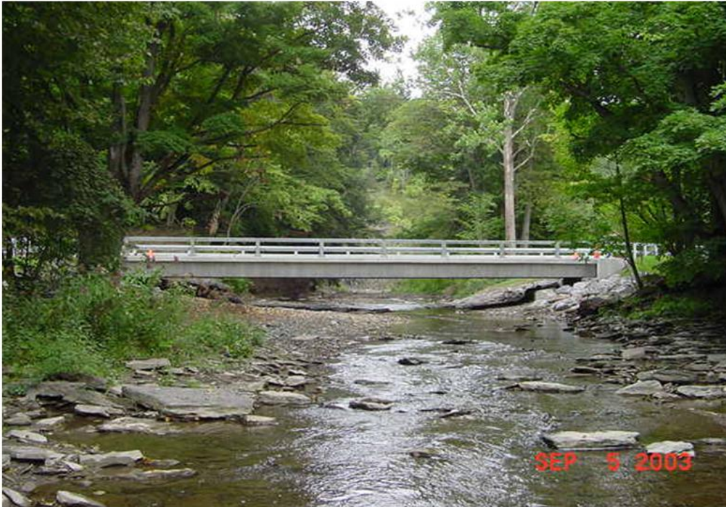
Average Erie County bridge length - 83 feet long