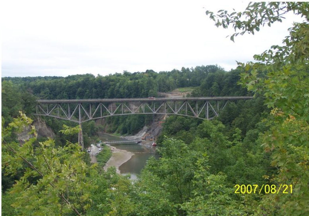
State bridge (BIN 1041590) – 652 feet long