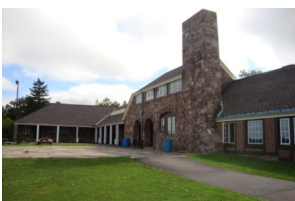
Take a guided walk through Chestnut Ridge Park on Saturday, May 19.

For additional information, contact the Parks Department at 858-7226 or visit www.erie.gov/parks .