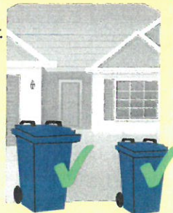
Place Wheels of Carts Toward House

Like us on Facebook for Recycling Tips & Info facebook.com/ModernDisposal