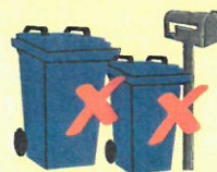
Objects & Carts Too Close Together