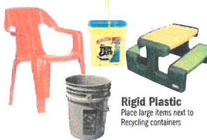
Rigid Plastic Place large items next to Recycling containers