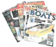
Magazines & Catalogs All types & sizes