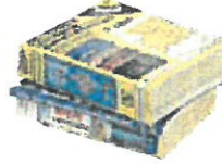
Phone Books All types & sizes