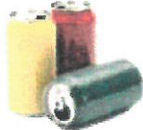
Aluminum Cans Empty cans only