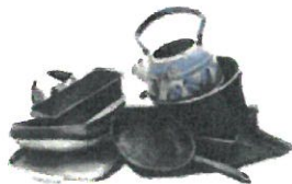
Kitchen Cookware Metal pots, pans, tins & utensils