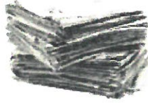
Newspaper Remove bags, strings & rubber bands