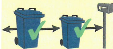
Keep Space Between Cart & Other Objects