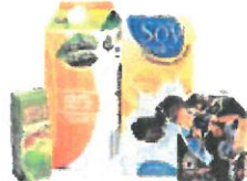
Food & Beverage Containers Empty containers only