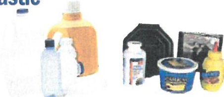
Plastic Jugs/Bottles/Household Plastic Empty containers only