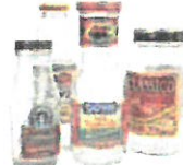
Empty & Clear Bottles & Jars Only