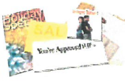
Office Paper & Junk Mail Envelopes, Flyers, Brochures, Postcards, etc.