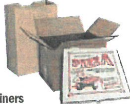
Cardboard, Pizza Boxes & Paper Bags Flatten cardboard & cut into pieces. Remove wax paper from pizza boxes