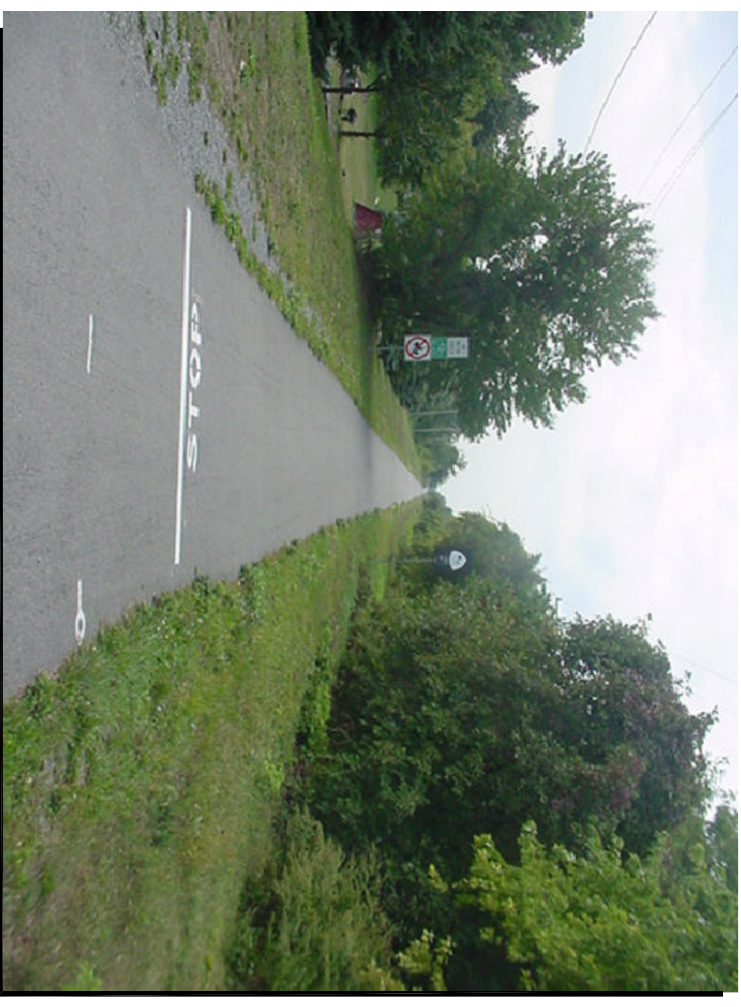
Existing off-road multi-use pathway along former railroad corridor in Akron.