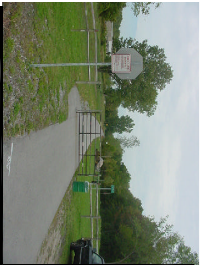
Existing off-road multi-use pathway along former railroad corridor in Clarence.