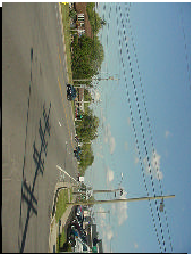
Existing on-road bike lane (without parking) along Walden Avenue in Lancaster.