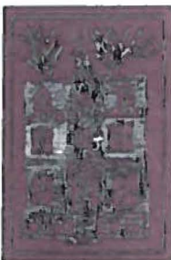
"MOLLYOLGA" DRAWING BY DARRYL MINNER

LOCUST STREET NEIGHBORHOOD ART CLASSES, INC.