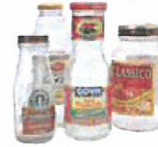
Clear Bottles & Jars