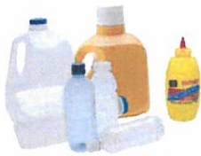
Jugs & Bottles with Small Top Openings