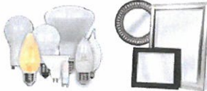
Light Bulbs & Plate Glass/Mirrors