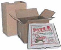
Cardboard & Pizza Boxes Flatten cardboard. Remove wax paper from pizza boxes