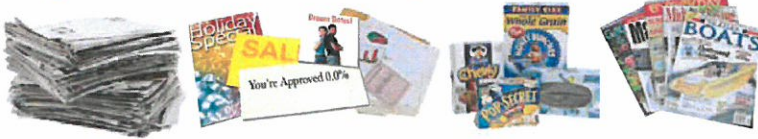
Newspaper, Office Paper, Paper Bags, Junk Mail, Paperboard & Magazines

Paper Place loose in cart. Use clear plastic bags for shredded paper ONLY .