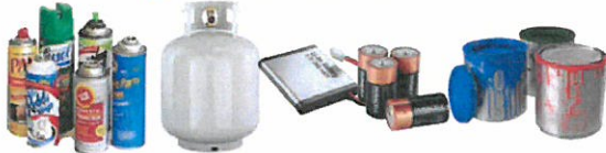
Aerosol Cans, Propane Tanks, Batteries & Paint Cans