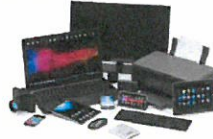
Electronics, Cords & Christmas Lights