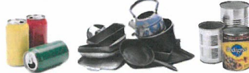
Aluminum Cans, Metal Cookware, Steel & Tin Cans